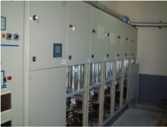
Figure 2: Elspec Equalizer at TCDD

The Equalizer achieves full network compensation within maximum one network cycle. This results in unity power factor, improved power quality and energy savings. Therefore TCDD is able to use smaller transformer for the same load or increase the load on same substation (allowing more trains in the segment), together with enhanced network reliability.